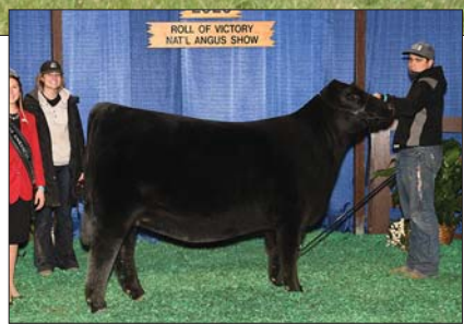
Dam of Lot 56, SSF Blackbird 4269