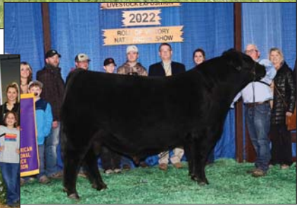
Hagg Black Crow, Grand Champion Angus Bull, '22 NAILE, Owned with Winegardner/ Klingaman & Haggard Angus, and full sib to Lot 55A.